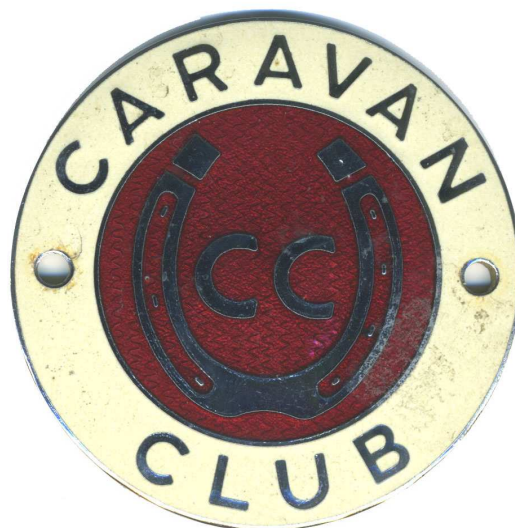
Figure 7: Circular Caravan Club car badge, date and manufacturer unknown.

At present, there is no evidence in the archive to suggest the dates of when this round example was manufactured.