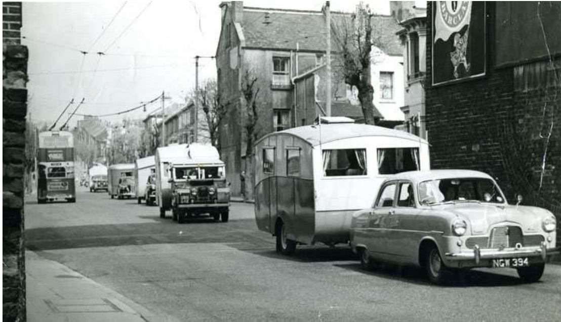
Figure 8: Caravan Club car badges are displayed on the grilles of these London Centre outfits passing through Brighton, 1954.