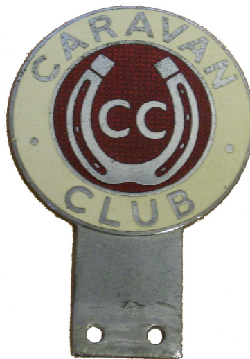
Figure 1: An example of the traditional chromium and enamel Caravan Club car badge.

Generally manufactured from chromium with red and cream enamel, the badge bears the iconic Club logo of a circle containing two C's (an acronym for Caravan Club) and a horseshoe which reflects the pursuit's horse-drawn heritage and '... stands for good fortune in caravanning'.