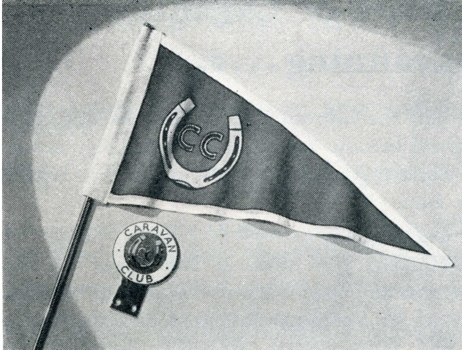
Figure 3: The first known image of The Caravan Club car badge.

badge, car badge, pennant and transfer ... the car badge is in red and white enamel and chromium plate'. Although the initial badge was issued free of charge, any replacement was charged at 5 shillings.