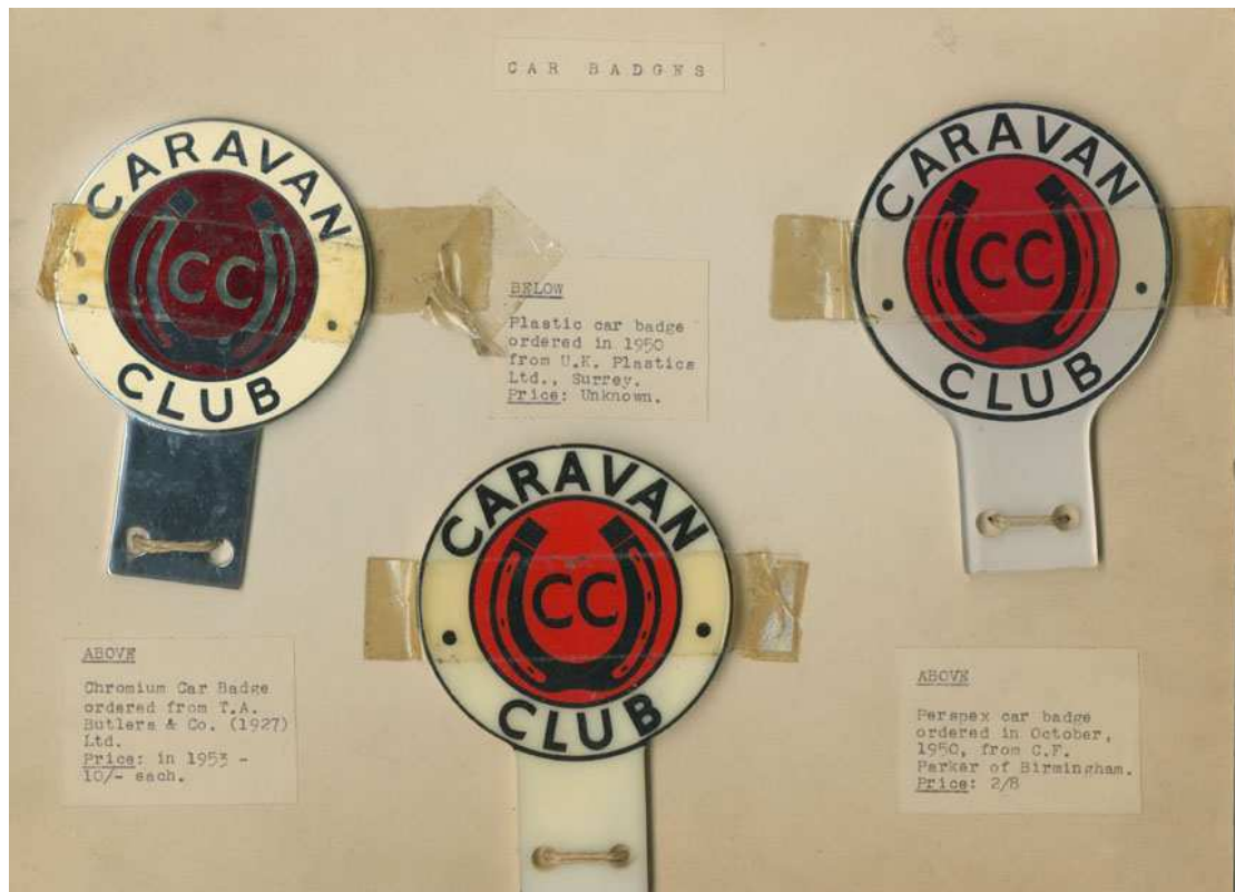
Figure 6: Memorabilia 'Sample Board' produced by The Caravan Club circa 1950s, in its pre-conservation state. From left to right: Caravan Club chromium and enamel car badge, 1953; Caravan Club plastic car badge, 1950; Caravan Club perspex car badge, 1950.