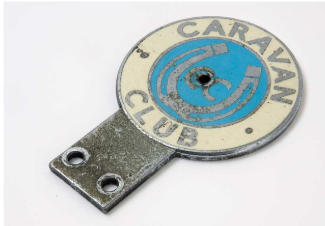
Figure 5: An example of a 1930s Caravan Club 'Associate' badge with sky blue enamel. From the private collection of Mr R. Hodgkinson.

Evidence suggests that these 'Associate' badges were produced from at least 1939 until the 1950s. The 1930s version are a pale 'sky' blue in colour, while the later versions adopt a darker 'royal' blue. It is not known at what date the tone of blue used on these badges changed.