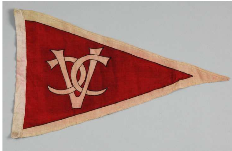
Figure 2: A pennant featuring the first Caravan Club logo.

used up until the 1930s when it was replaced by the horseshoe logo visible on the car badges.